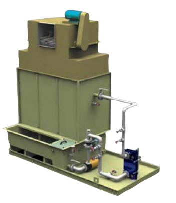
Liquid desiccant packaged conditioner