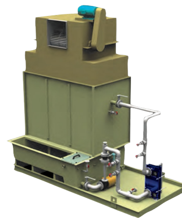
Liquid desiccant packaged conditioner

Alfa Laval Kathabar Phone +1 716-875-2000 Email: sales.kathabar@alfalaval.com Web: www.kathabar.com