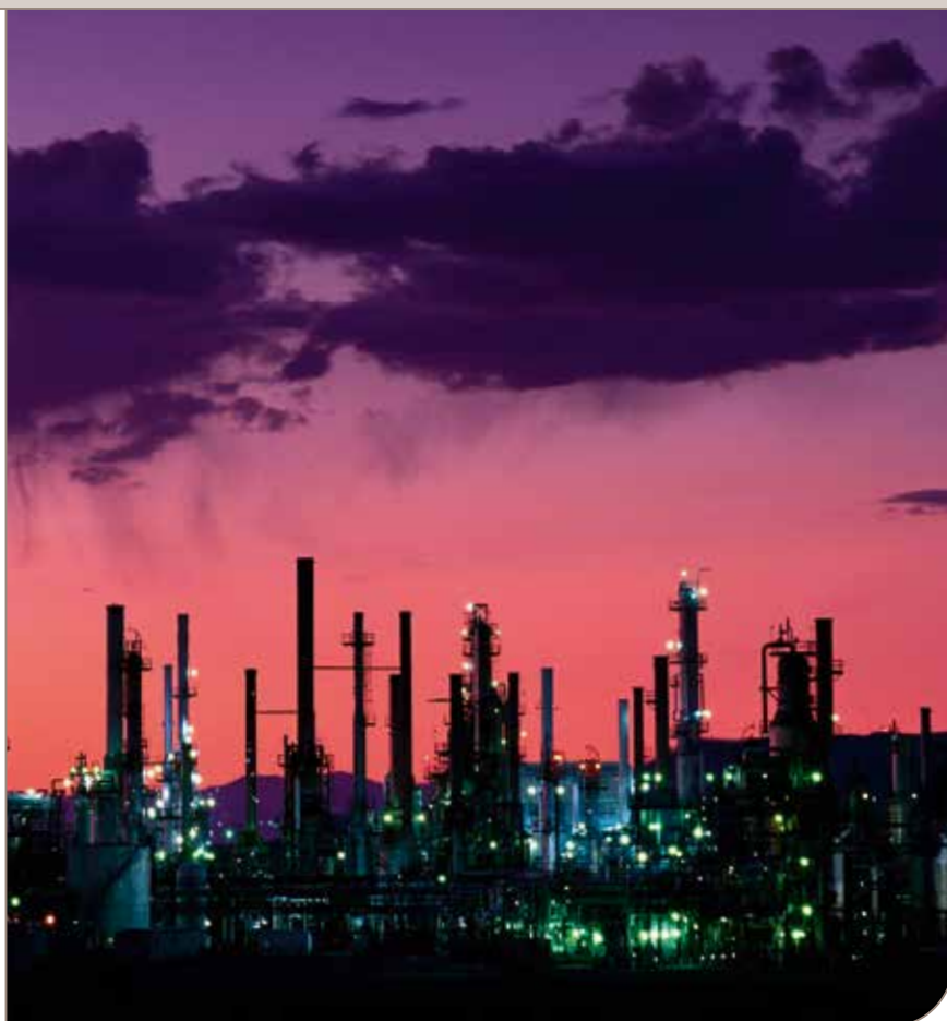
Continuous growth in the plastics industry has caused petrochemical manufacturers in Brazil to expand their plants.

The two Compablocs were installed as quench water coolers in the Braskem plant's quench water tower. Braskem olefins unit process engineering is quick to point out that besides taking up only a fraction of the space, "they were less complicated – and faster – to install than shell-and-tube heat exchangers."