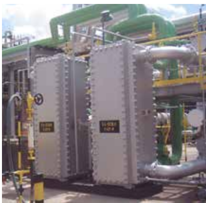
The two space- and maintenance-saving Compablocs at the Braskem plant