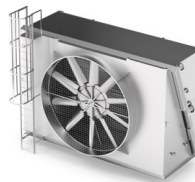
Air Cooled Exchangers