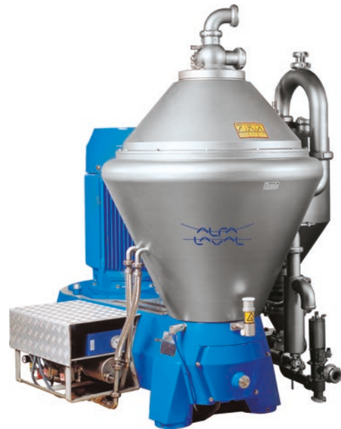
Belt-driven high speed separator.