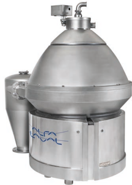
Direct drive high speed separator.