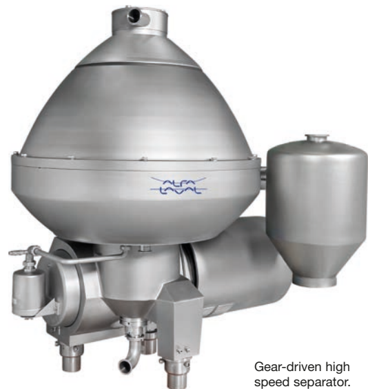
Gear-driven high speed separator.